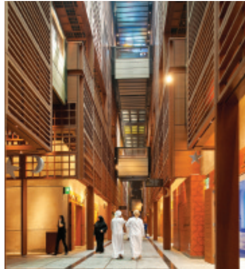
SAS's portfolio includes The Souk at Abu Dhabi's Central Market.

As well as the 'Building for the Future' seminar from 4.15pm to 4.45pm today, SAS International will hold